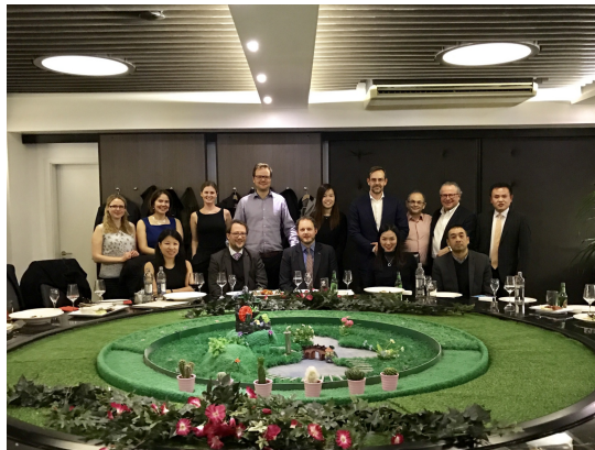
ChinaLux Executive Board Dinner

We are very grateful for the ongoing support of ChinaLux Members and Friends, and look forward to seeing you all at upcoming events, and at the 2017 AGM - details for which will be announced in the coming weeks.