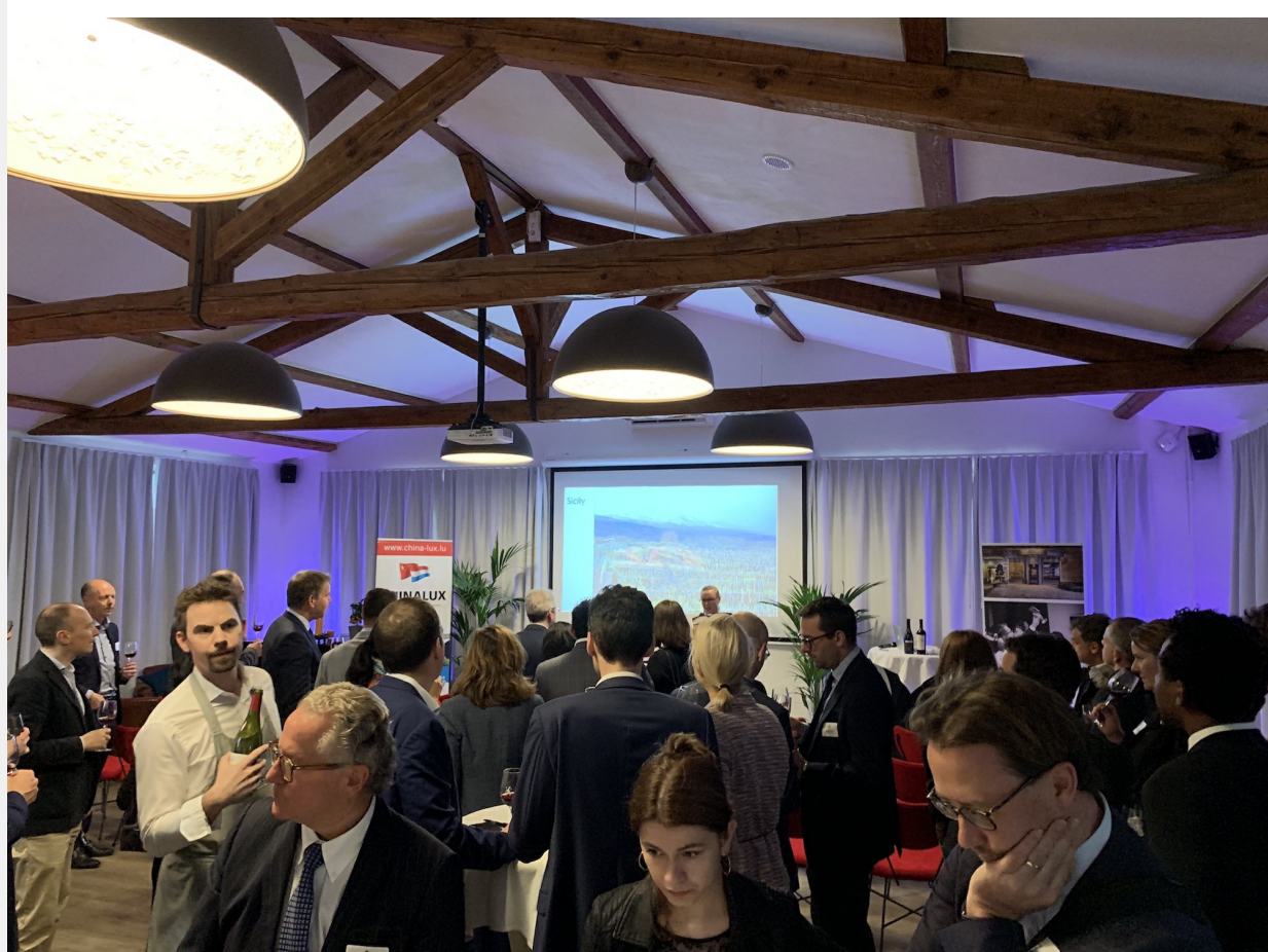
25 April 2019, ChinaLux Extraordinary General Meeting