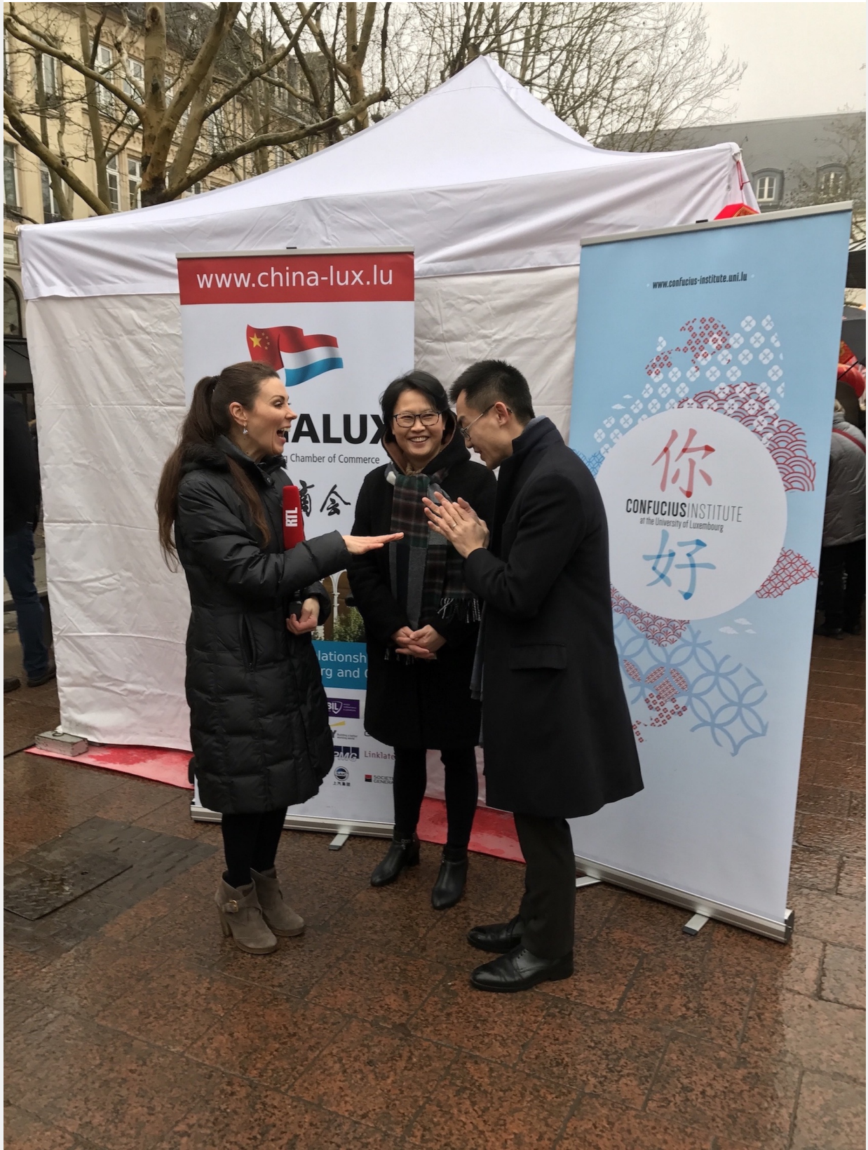
Chinese New Year Celebration: ChinaLux were delighted, alongside the Confucius Institute at University of Luxembourg and the Union Commerciale de la Ville de Luxembourg to co-organize the Chinese New Year Celebration, which took place on 26 January 2019.