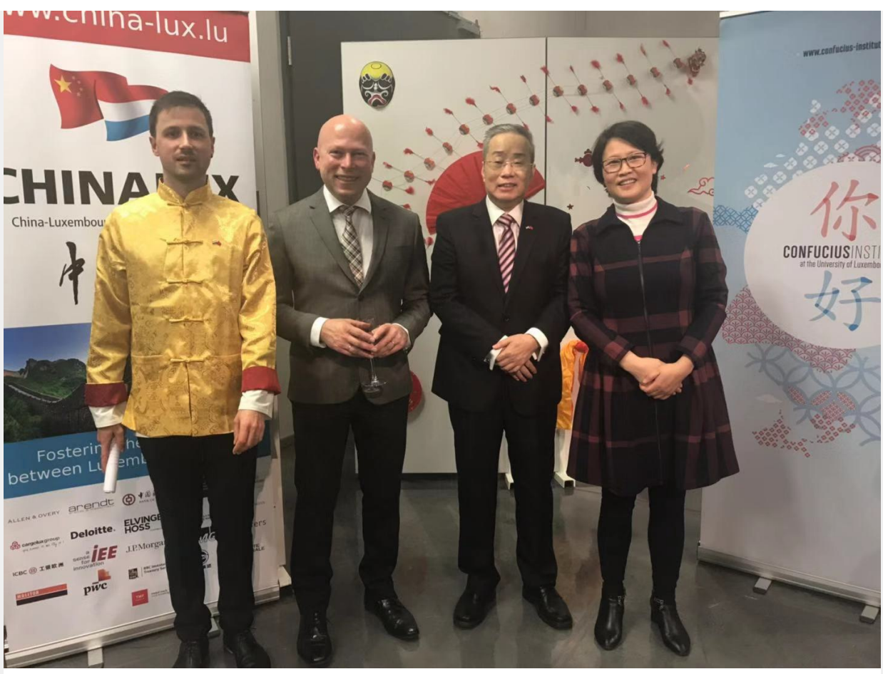
Music of Fudan: On 27 January 2019, together with the Confucius Institute at University of Luxembourg, ChinaLux hosted the first Chinese New Year Concert at the Tramsschapp Cultural Centre.